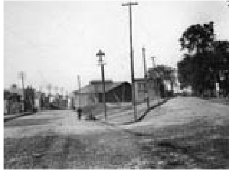
Old Hill St. and Fifth Ave.

The picture is circa 1900. Notice the horse drawn wagon heading north on 5th Ave. the gas street lamp at Hill & 5th, the streetsweeper on Hill St., and railroad crossing gates.