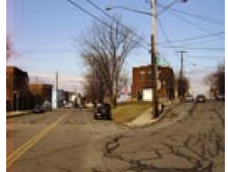
New Hill St. and Fifth Ave.

on the Russell Sage College campus in downtown Troy on Wednesday, 07 November, from 5:30 to 8:30 p.m. Admission is $65 ($40 of which is tax deductible if you attend). Business attire recommended. We'd greatly appreciate an RSVP, if possible, but we will take walk-ins the evening of the event, so don't skip it if you fail to call first but you want to come. You can send in notification either by email at carroll@rpi.edu , or by phone to 274-5267.