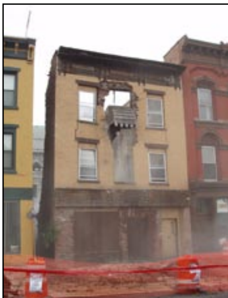
The demolition of 229 fourth St.

The Record , October 9, 2007, p3, 8. ‘Flags fly in honor of Troy’s Italian Americans’ by Kathryn Caggianelli, American and Italian flag raising ceremony at Columbus Monument in Columbus Square with coordination and participation by the Knights of Columbus, the Italian Community Center, Troy’s Little Italy and city leaders.