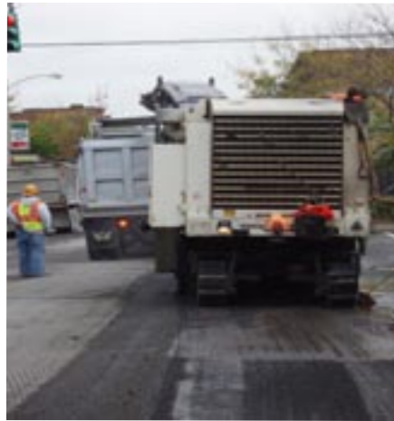
Guys scraping up old paving on 4th St.

While crossing the street in front of Vanilla Bean and while taking pictures of the repaving operation I happened to look down at the street and there, where the old paving had been scraped to prepare for the new surface, were granite cobblestones peering up at me. I must say that I was surprised and a little delighted to see this little bit of Troy history exposed. I took a picture of them, too, and while it's a rather boring picture, at least I have proof that they are there, now buried under inches of bitumen, never to see the light of day for another 20 years or so. Do you know how much granite paving goes for these days? Think of it as buried treasure.