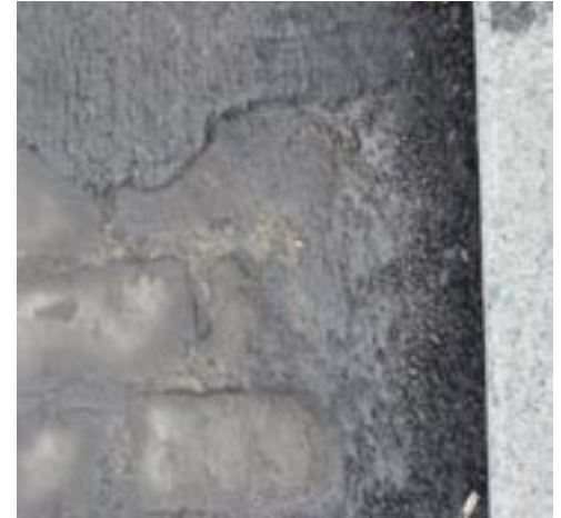
Exposed cobbles in front of Vanilla Bean